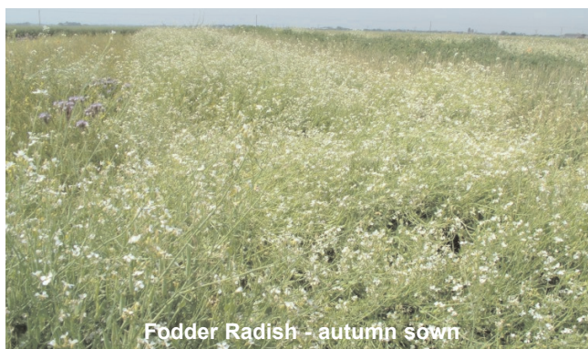
Fodder Radish - autumn sown