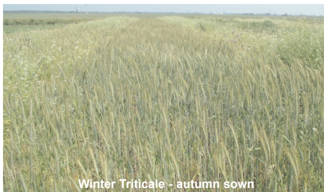
Winter Triticale - autumn sown