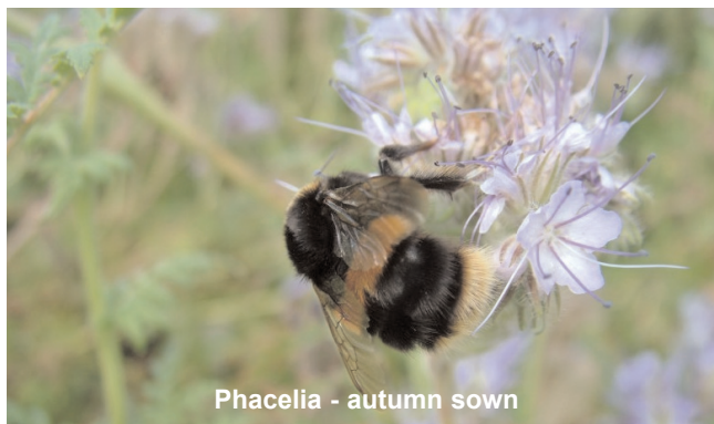
Phacelia - autumn sown

If you want an autumn sown mixture to attract the farmland birds then sow MAGNET!