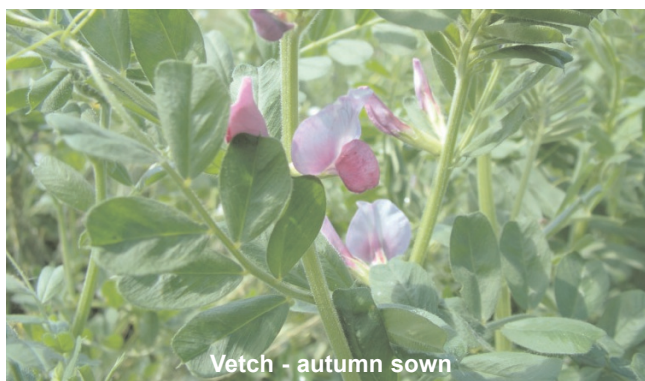
Vetch - autumn sown