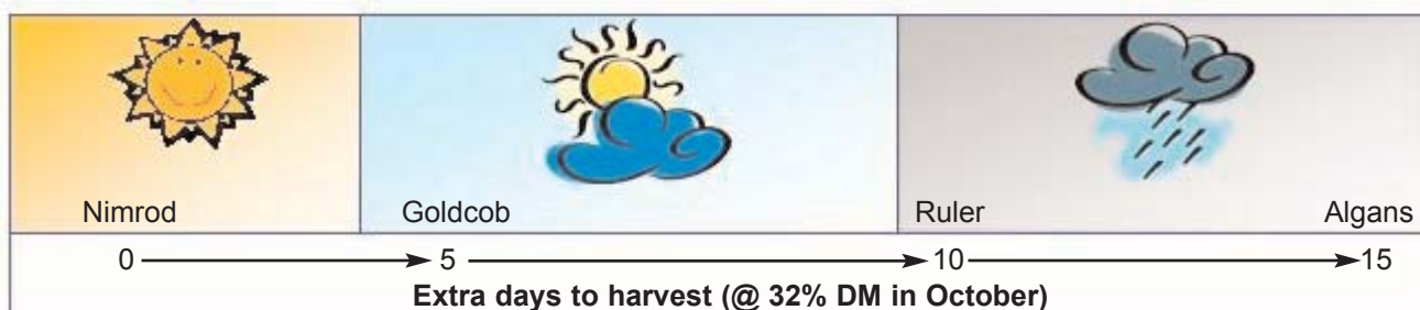
Harvest Window (NIAB Less Favourable Sites - 2006 list)